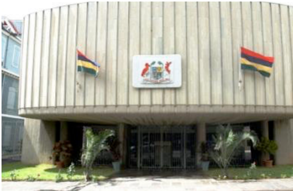
Parliament House, Port Louis